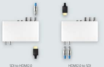
SDI to HDMI2.0